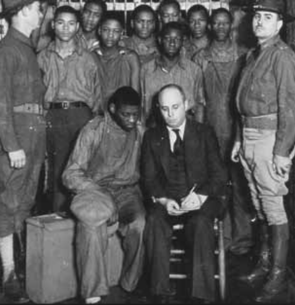
The Scottsboro Boys

Visit olli.berkeley.edu for syllabi, reading lists, and other course materials.