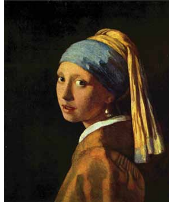
Girl with a Pearl Earring by Johannes Vermeer

To celebrate the de Young Museum's exhibit Girl with a Pearl Earring , study masterpieces representing a range of subjects and techniques from the Dutch Golden Age of the 17th century. Gain insight into the political, economic, and technological innovations that inspired artists to new heights, including a turn