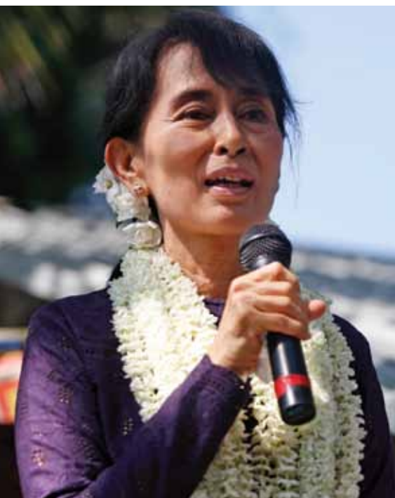
Aung San Suu Kyi

Visit olli.berkeley.edu for syllabi, reading lists, and other course materials.