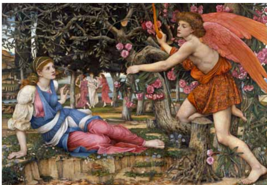
John Spencer Stanhope, Love and the Maiden , 1877