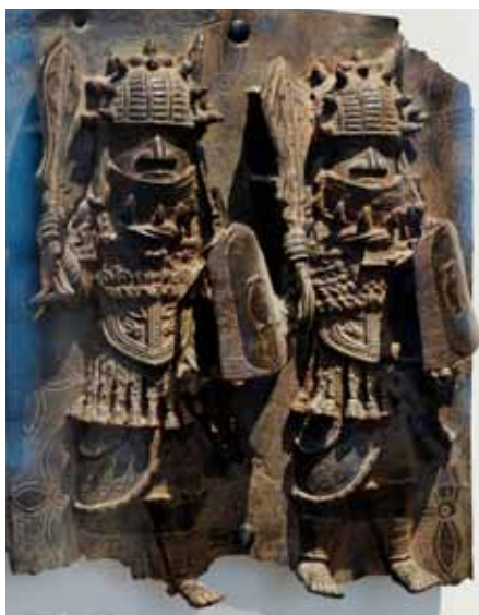
Bronze warriors, Benin Kingdom, 16th-18th century, Nigeria

See the centerfold for a calendar and map.