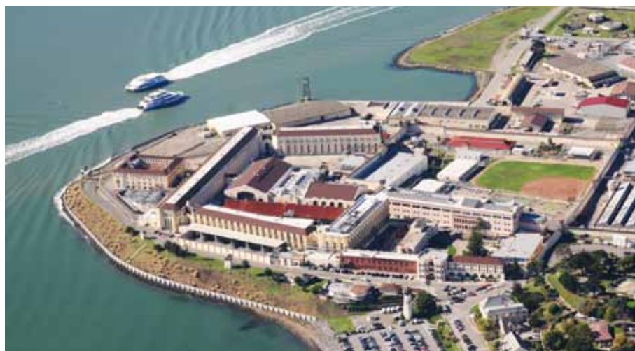
San Quentin State Prison