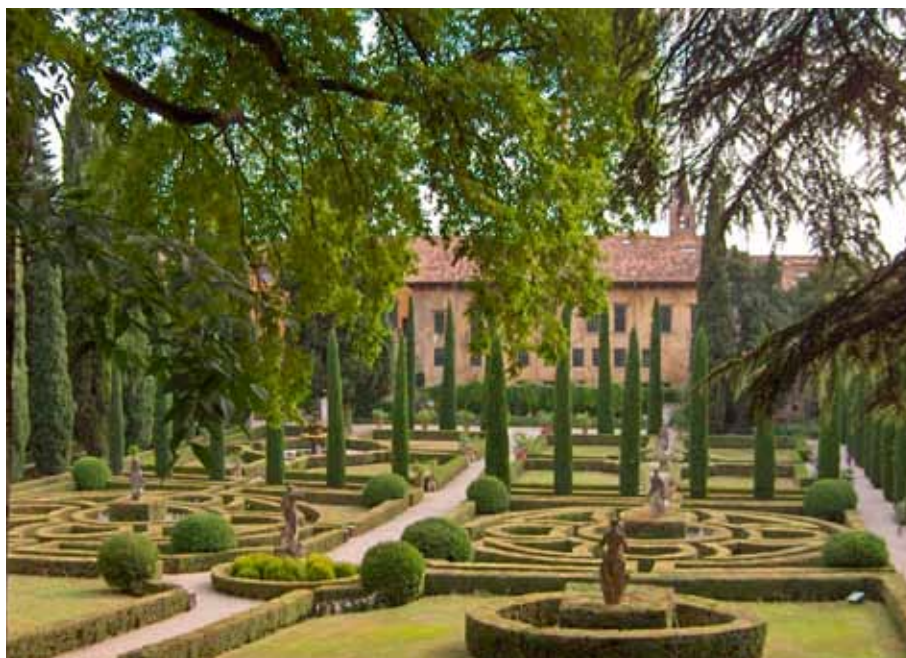
Garden by Giardino Giusti in Scaligeri, Verona